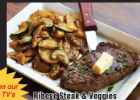
Ribeye Steak & Veggies

Daily Food + Drink Specials Happy Hour Daily 3 pm - 6 pm