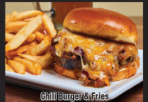
Chili Burger & Fries

$5 off Any Order of $25 or more Code: SHP2201