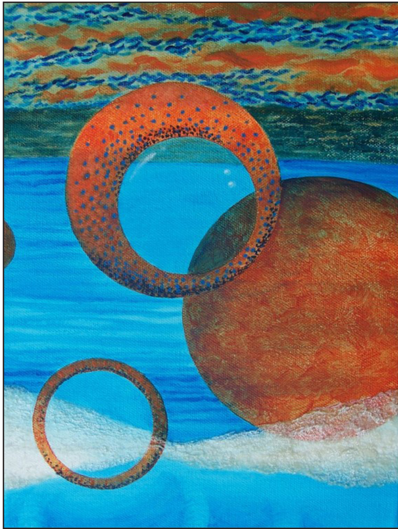
Tina Ybarra's "Oceans & Gateways" will be on display at the Rod Briggs Gallery until Oct. 22.

a statement to the Signal Tribune . "[...] These figurines have become very special to me and increasing the scale of these small objects have made them more impactful and meaningful for me."