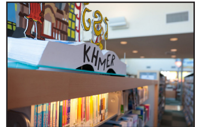
A sign and artwork by Cambodian residents shows where section for books written in the Khmer language is in the Mark Twain Community Library in the Cambodia Town neighborhood of Long Beach.