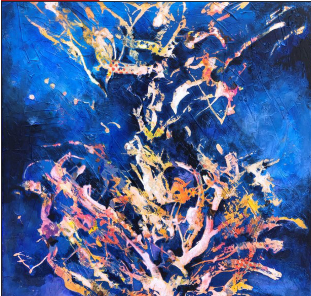
"Catapult" by Linda-Jo Russell is included in the "Inspired By" exhibit organized by the Long Beach Creative Group.