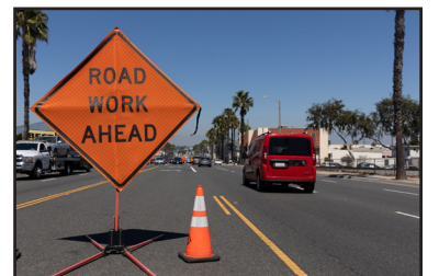
Richard H. Grant | Signal Tribune

The contract allocates $294,491.40 to Excel Paving Company for the Ohio Avenue Street Rehabilitation Project, which will include the removal and replacement of approximately 560 square feet of damaged sidewalk, restoration of traffic striping and markings, improvement of two ADA access ramps and the repair of ap-