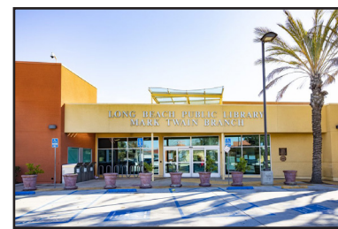
An exterior photo of the Mark Twain Neighborhood Library, located at 1401 E. Anaheim St., in the Cambodia Town neighborhood of Long Beach.