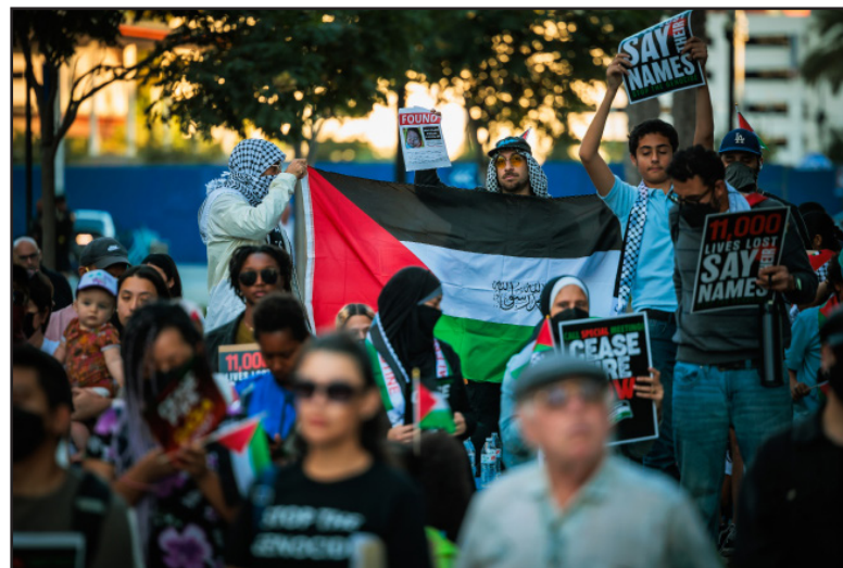
People cheer and applaud the speakers during a rally in support of the civilians in the Gaza Strip at Long Beach Civic Plaza on Nov. 14, 2023.