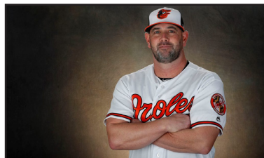
Former Long Beach State baseball player Brandon Hyde was named MLB American League Manager of the Year.

coaching positions for the Chicago Cubs from 2013 to 2018.