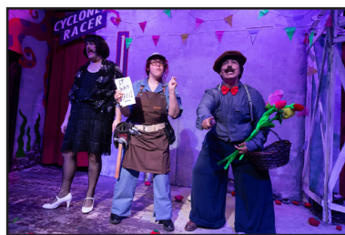
“Terror at the Pike” mixes Long Beach history, humor and an eccentric cast in The Garage Theatre’s third iteration of the show.

One of the episodes dives into when the Long Beach harbor was effectively “sinking” due to oil extraction. The eastern end of Terminal Island had dropped about four feet, and the Long Beach breakwater had dropped two feet. In the show, the characters will face a flooding city caused by a nefarious magician.