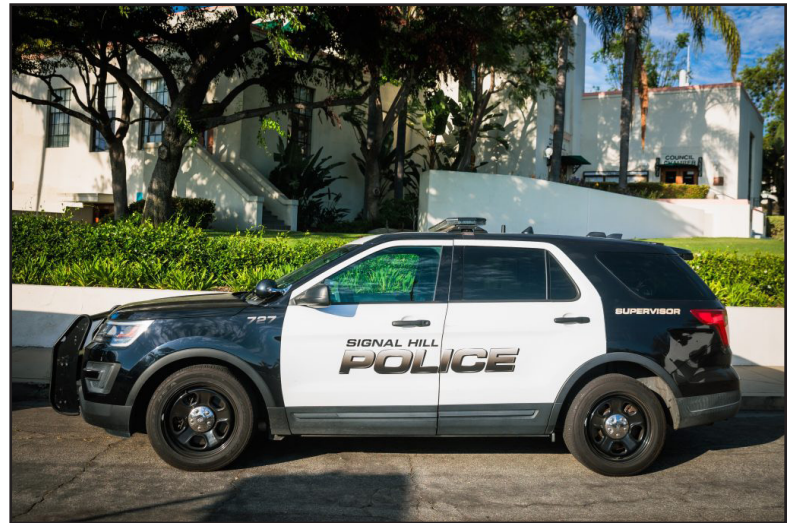
A Signal Hill Police patrol vehicle sits outside of Signal Hill City Hall on Aug. 1, 2023.