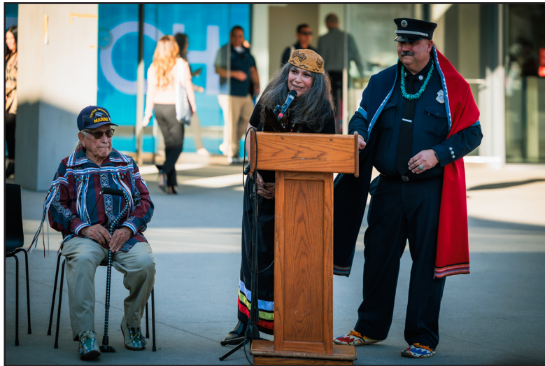
Members of the Native Employees Organization speak during an event in honor of Native American History Month at Long Beach Civic Plaza on Nov. 14, 2023.