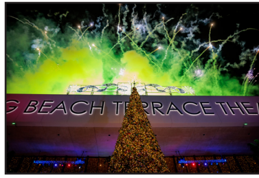
Fireworks erupt from the top of the Long Beach Terrace Theater after the lights are turned on for the Christmas tree during the 8th annual Tree Lighting Ceremony on Dec. 5, 2022.

Tickets include decorating supplies, a gingerbread house and will allow entry for one accompanying adult per purchase. The recommended age for this class is from 4 to 15 years old. The first two classes will be taught at Confidential Coffee and the last two classes will be taught at The Pie Bar. Tickets can be purchased on Eventbrite.