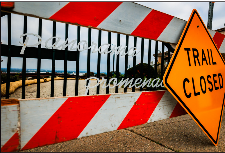
Signs block passage onto the Panorama Promenade Park Trail in Signal Hill on Feb. 27, 2024 due to land erosion caused by a series of storms. The Signal Hill Emergency Operation Plan was last updated in 2017.