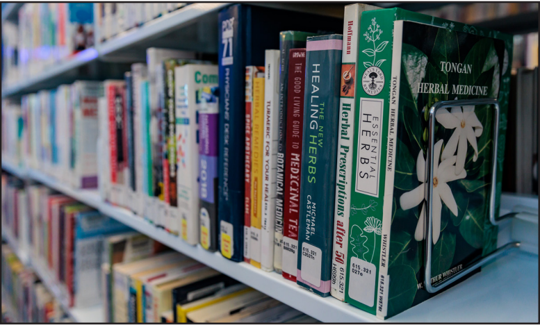
Books about herbs sit on the bookshelf inside the Michelle Obama Neighborhood Library in North Long Beach on Jan. 4, 2022.