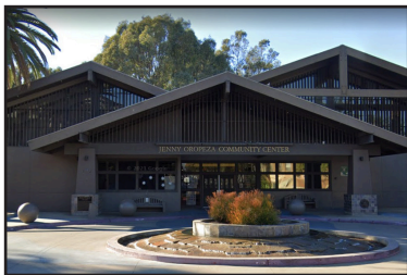
The Jenny Oropeza Community Center is located at 401 Golden Ave.

Programming is expected to begin in the next few weeks, according to the City.