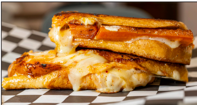
The Carrot from Long Beach sandwich shop Dilly's is made with roasted carrots, kimchi and monterey jack cheese on ciabatta bread.

Changes to the local food scene have also come more recently in the form of rising food prices and the chilling effects Immigration and