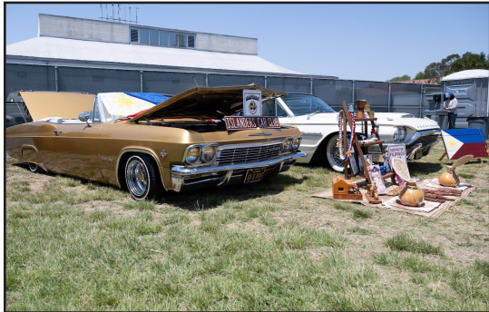
A classic Chevy Impala SS and Ford Thunderbird from the Islanders Car Club are parked on display with several traditional Filipino items on May 9, 2026.