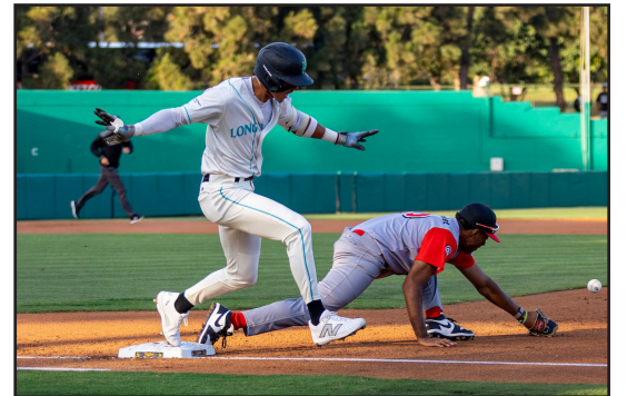
Samuel Chacko | Signal Tribune

In front of a raucous, sold-out crowd, the Long Beach Coast defeated the RedPocket Mobiles 13-4 thanks to great hustle, offense and defensive displays on June 2, 2026.