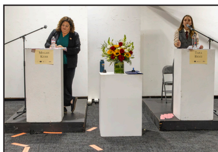
Samuel Chacko | Signal Tribune

According to the first batches of primary results, the most contentious Long Beach races are for the District 1 and 5 city council seats.